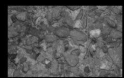
Undetectable bone fragments above are made visible in the bottom left photo using the 395nm UV Light and 455nm bottom right. (Orange barrier filter goggles used to view 455nm.)

The 395nm UV Light Source should always be used in the preliminary examination and location of physical evidence. It features five UV LEDs and operates from two CR123 Lithium batteries. Use UV Spectacles for general eye protection.